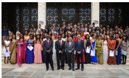
OUR 71 GRADUATES AND THEIR ACHIEVEMENTS