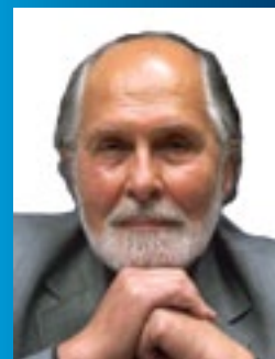
Dr. Sayyed Hossein Nasr

This conference will bring together leading scholars of Shi'i Islam to share perspectives on their rich heritage within the broader Islamic world, and to identify efforts to increase interest in the study of Shi'i Islam in North America. The conference will also launch a campaign to endow a chair for the study of Shi'i Islam at Hartford Seminary, the first such chair in North America.