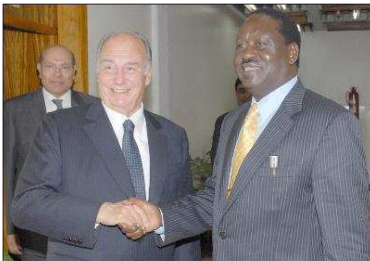
Coastweek -- His Highness the Aga Khan meets with the Rt. Hon Prime Minister Raila Odinga.

Coastweek -- His Highness the Aga Khan, accompanied by his daughter Princess Zahra, ended a week-long visit to Kenya to view progress on various projects of the Aga Khan Development Network (AKDN) in the country.